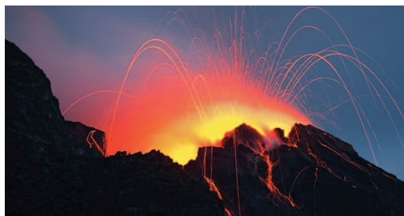
FIGURE 4 In Stages 3 to 5 of mineral evolution, a variety of igneous and metamorphic processes increased the diversity of mineral species. Mount Stromboli (shown here in eruption, October 2007) is an arc volcano formed as the African Plate subducts under the Eurasian Plate. Plate tectonics is an example of mineral-forming processes that first emerged in Stage 5.

Because of plate tectonics, Earth experienced yet another pulse of mineral evolution (Stage 5; FIG. 4). Subduction of H_2O -rich, chemically diverse crustal materials led to fluid–rock interactions and associated rare element concentration on a vast scale, notably forming massive sulfide deposits with more than 150 new sulfosalts. Dozens more mineral species first appeared at Earth's surface from the uplift and exposure of deeply subducted domains containing a wealth of high-pressure, low-temperature minerals formed along the anomalously low geothermal gradients in subduction zones.