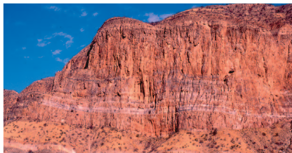
FIGURE 5 Neoproterozoic "snowball Earth" events (Stage 9) were characterized by alternating episodes of global glaciation and rapid deposition of cap carbonates with giant crystal fans of aragonite. This 100 m section from the Skeleton Coast of Namibia exposes glacial deposits (lower slopes) overlain by carbonates (cliff faces).

The Phanerozoic mineralogical innovation of bioskeletons of carbonate, phosphate, and silica (FIG. 6) resulted in new mechanisms of mineralization that continue to influence Earth's near-surface mineralogy (Stage 10; Dove 2010 this issue). At the dawn of the Cambrian Period, Earth's subaerial surface was, as it had been for most of the previous 4 billion years, mostly barren rock. The rise of land plants