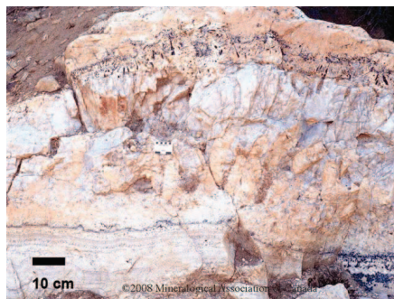
FIGURE 3 Granitization and the formation of pegmatites (Stage 4) significantly increased the mineral diversity of Earth's near-surface environment. This image shows a surface exposure of the San Diego gem pegmatite, Mesa Grande, California. FROM LONDON 2008

Stage 4 of mineral evolution requires that a planet possess sufficient inner heat to remelt its initial basaltic crust, resulting in the formation of granitoids. Pulses of mineralogical novelty arise from repeated partial melting and concentration of rare elements to form complex pegmatites and their approximately 500 distinctive minerals of Li, Be, B, Nb, Ta, U, and a dozen other rare elements (FIG. 3). These elements have been present since the time of the ur-minerals, but in concentrations too low for the formation of discrete phases rich in the rarer elements. It takes