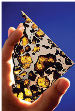
FIGURE 2 Stage 1 of mineral evolution saw the initial diversification of minerals, as represented in primitive meteorites. Pallasite meteorites, an example of which is shown here, contain olivine crystals in an iron–nickel matrix. These phases are products of the differentiation of planetesimals into mantle and core that occurred during Stage 2.

and O_2 ; and (3) the generation of far-from-equilibrium conditions by living systems that produce thermodynamically metastable minerals and the ability of their metabolic processes to catalyze mineral-forming reactions that would not occur abiotically. The extent to which these processes act at or near a planet's surface will determine its degree of mineral evolution. On Earth we envision a history with an additional two eras and eight stages, whereas most other planets and moons experienced only the first era.