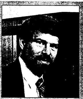
Carnegie Institution of Washington